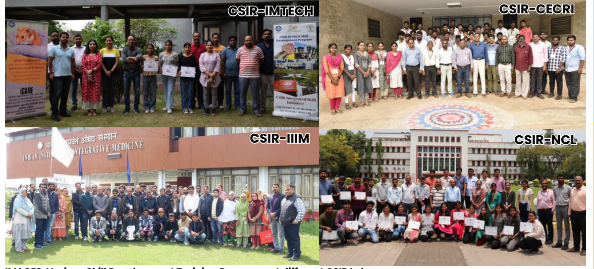
IMAGES: Various Skill Development Training Programs at different CSIR Labs.