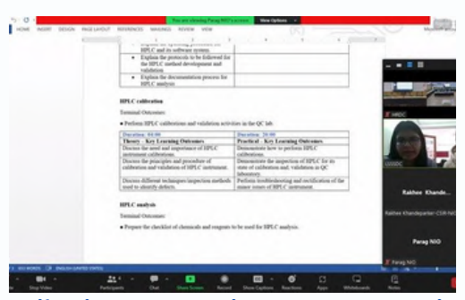
Life Sciences Sector Skill Development Council (LSSSDC) & CSIR-National Institute of Oceanography (NIO), Goa on 20th February 2024.