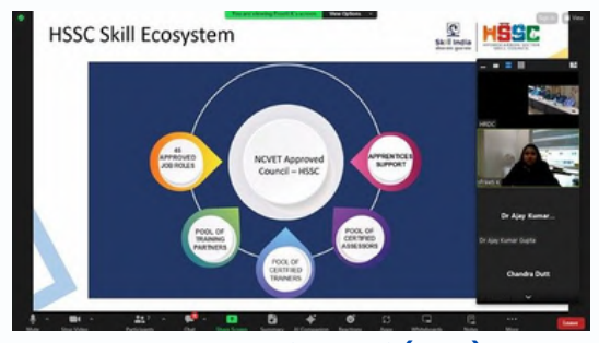
Hydrocarbon Sector Skill Council (HSSC) & CSIR-Indian Institute of Petroleum (IIP), Dehradun on 21st February 2024.